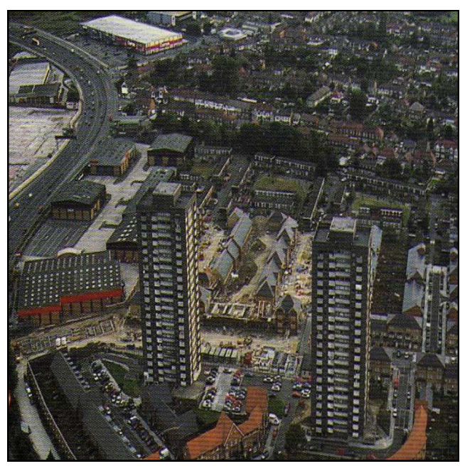
Cities of UK