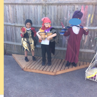
Communication and interaction