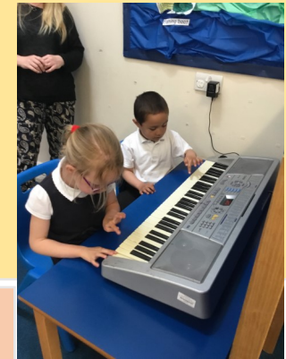
Cognition and learning