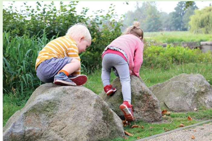
Forest School leader